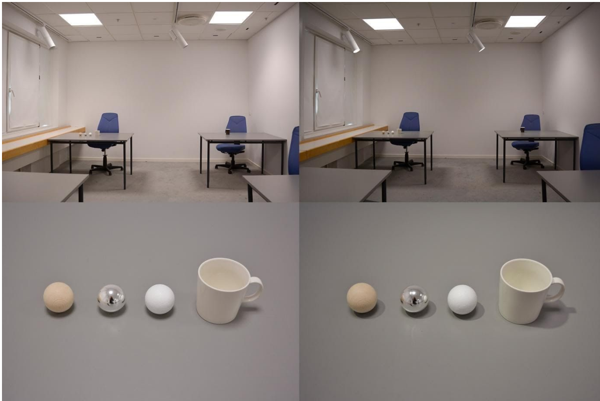
Fig. 1: The two photographs are showing the visual appearance of the space and difference of light modelling of objects with only diffuse lighting 0:100 ratio (on the left) and 45:55 ratio of direct:diffuse lighting (on the right). See Research Paper 3.

parallel mixed method approach with interviews and questionnaires revealed several findings in favor of Double Dynamic Lighting, in comparison to static lighting.