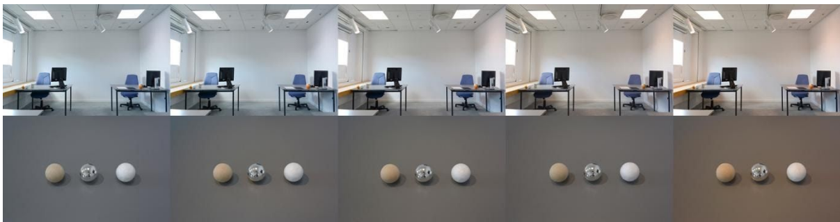
Fig. 2. Registrations of 5 different lighting settings, illustrating the light distribution and perceived CCTs of the space and of objects on a work desk. See Research Paper 3.